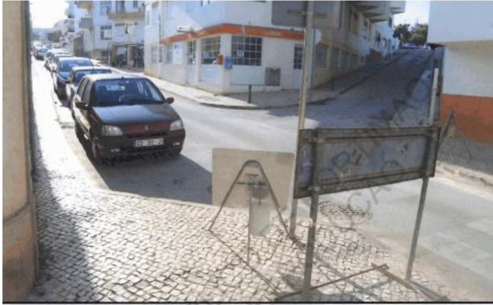
UADRAMENTO – RUA 25 DE ABRIL E RUA DA ESCOLA PRIMÁRIA