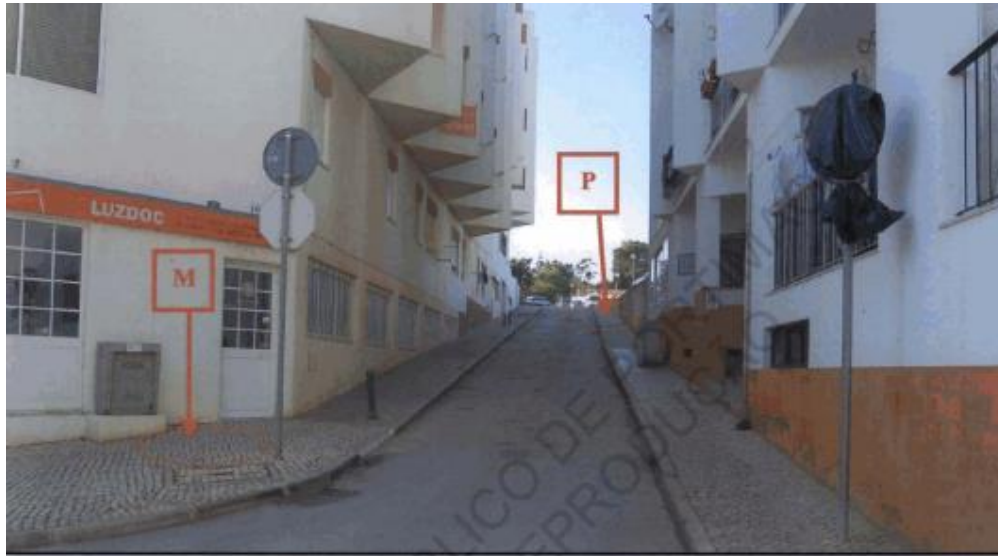
TO 6 – ENQUADRAMENTO – As indicam o local onde as testemunhas viram, cruzaram-se, com o indivíduo suspeito, o “M” - MARTIN SMI o “P” - PETER SMITH, na rua da Escola primária