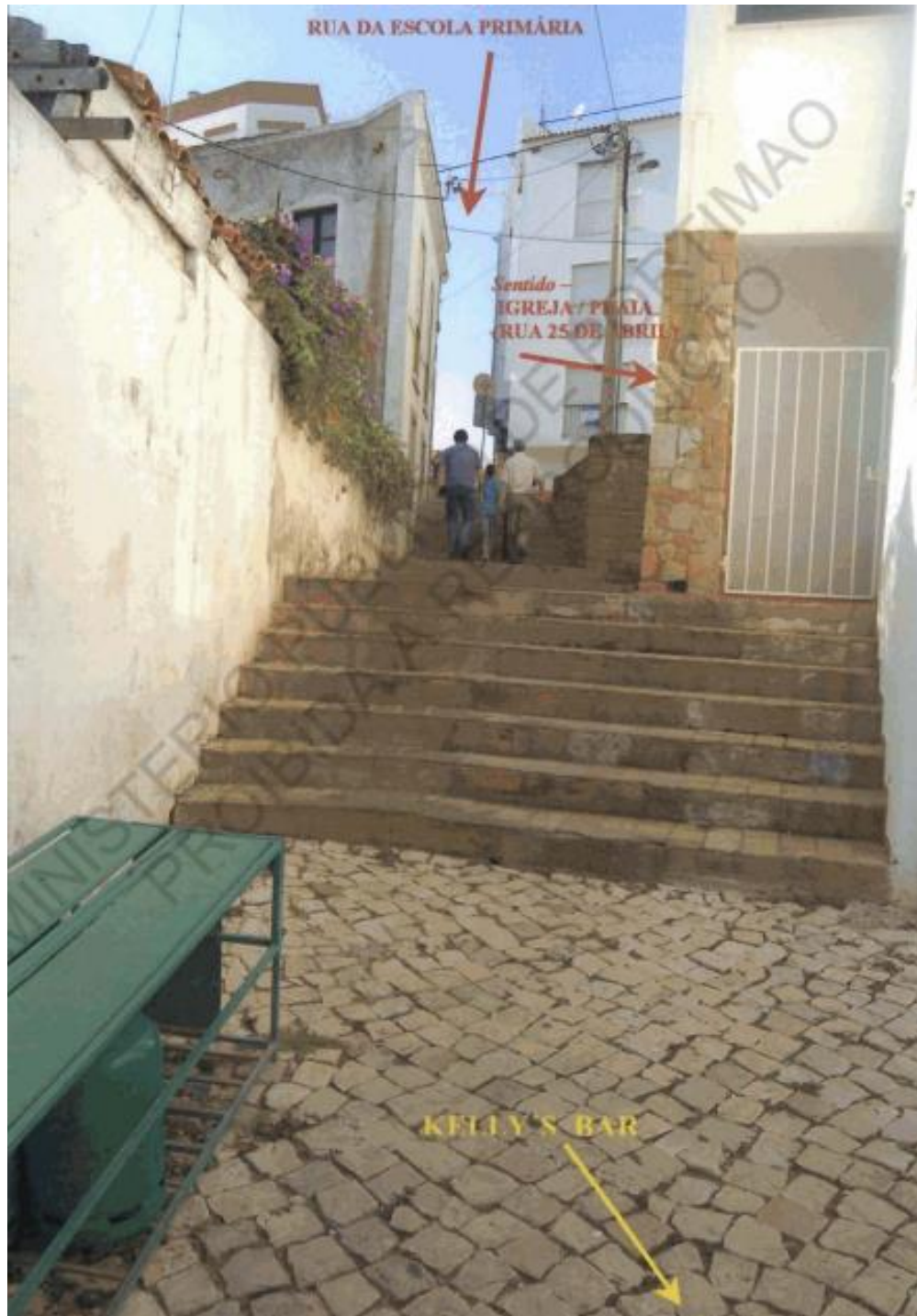
SMITH SIGHTING 2 - 06_VOLUME_VIa_Page_1621